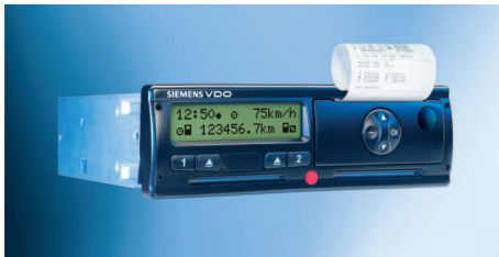
The DTCO 1381 from Siemens VDO

Based on this, vehicle manufacturers are expected to start incorporating digital tachographs into new vehicles from spring/summer 2005. As yet there is no obligation to upgrade existing registered vehicles.