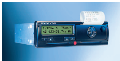
The DTCO 1381 from Siemens VDO

Regulation (EEC) No. 2135/98 covers the introduction of Digital tachographs. The combination of electronic data management and driver-specific smart cards is intended to improve road safety and the new directive applies to all EU member states, plus Switzerland, Norway, Liechtenstein and Iceland. New vehicles with a gross weight in excess of 3.5 tonnes and buses with more than 9 seats will be affected, but due to various delays in implementing national legislation and setting up the corresponding infrastructure, the mandatory installation date for digital tachographs looks set to be postponed by 12 months to 5 August 2005.